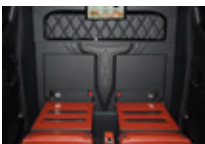
Semi-flat fold-down seats. Passengers can seat facing each other.*1

Services Amenity service (wet wipes, blanket, slippers, USB cable, etc.)