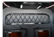
Privacy partition. Can be rolled up/down electrically.