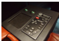
Fully-electric recliners with a massage function and air seat function