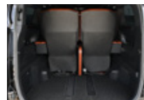
Rear luggage storage area**