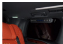
Rear seat A/C controller equipped