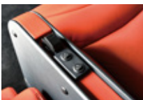
Controller for partition Controller for indirect lights (located on the floor and ceiling)