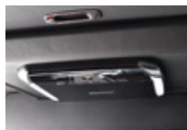
Retractable LCD monitor (manual)